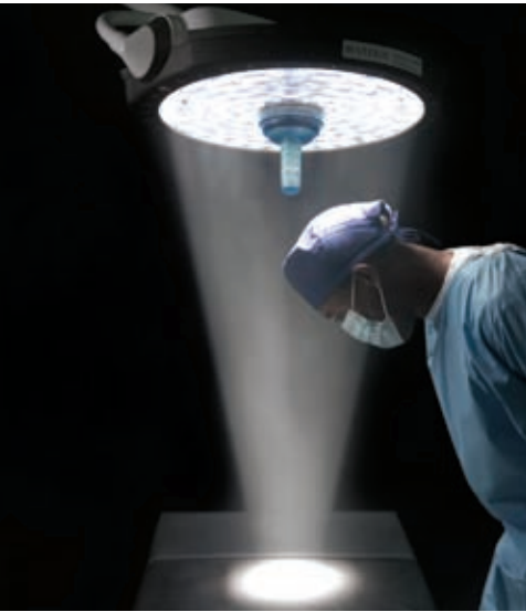
Figure 2. With LED lighting, distracting shadows created by the surgeon's head are virtually eliminated from the surgical field.

To determine how well a light renders deep, saturated red colors (the most critical color for surgical procedures) the lighting industry developed a special measurement, called the R9.