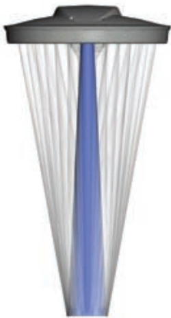
Figure 1. Each LED lens creates the entire pattern, so no matter how many you block, the spot remains clear and consistent.

The consistency of LED light means surgeons are not distracted by shadows moving across the pattern. In fact, some surgeons have commented that when using the LED lights, they no longer feel the need to wear their headlamps!